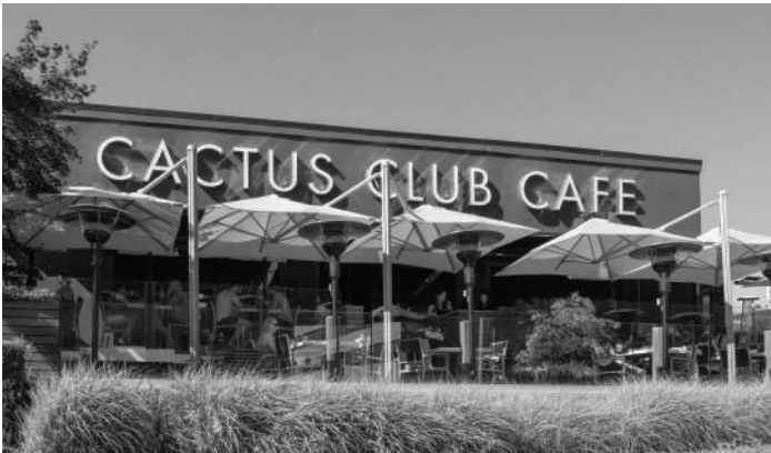
Satisfy any craving at dozens of restaurants and eateries.