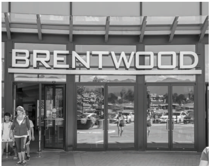
03/ Find everything at Metro Vancouver's newest luxury shopping destination.

Standing in an unrivaled central location, Akimbo's energetic tower rises above Brentwood's all-new high street. Experience the convenience of Dawson Street's accessible commerce and central plaza. Enjoy top-tier dining, street-front patios, independent retailers, and direct access to both the Gilmore and Brentwood Town Centre SkyTrain stations. Minutes from Highway 1 and the Central Valley Greenway, Akimbo is designed to get you moving (and keep you out of gridlock).