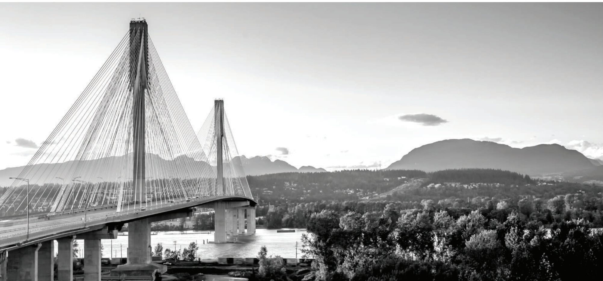
01/ Get moving: Highway 1 is just a 4 minute drive away.