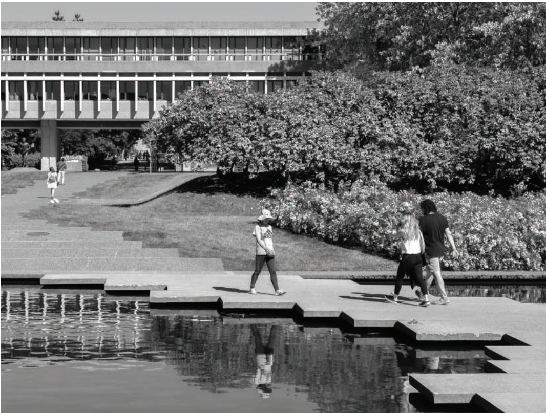
Cut your commute: SFU and BCIT are less than 10 minutes away.