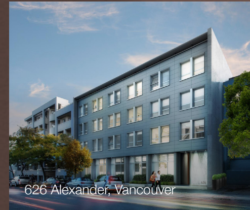
626 Alexander, Vancouver